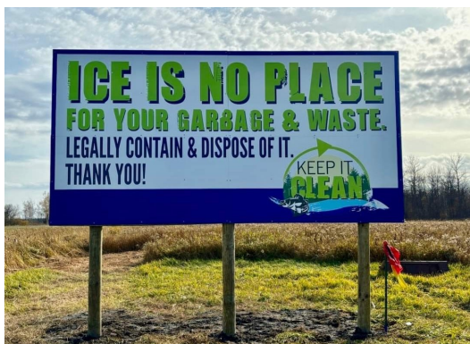
Look what popped up in Waskish! Thanks to Ross Lewis Sign Company and the Waskish Township. Funding is from the Minnesota Clean Water Land and Legacy Amendment.